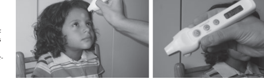
Figure 1 Measurement of body temperature using a non-contact infrared thermometer. (a) The device is placed in front of the child's mid-forehead. The luminous pointer indicates the correct distance to perform the measurement. (b) The temperature measured is shown on the display. Used with permission.

To assess the variability of repeated measures (reproducibility) of the NCIT, children had triplicate measures of body temperature. Clinical repeatability was calculated, as a measure of the reproducibility of three repeated temperature measurements, defined as the SD of the differences between