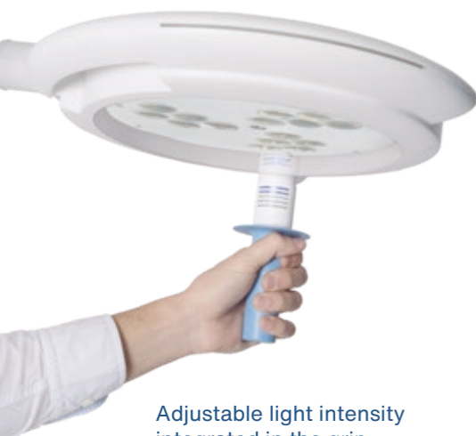
Adjustable light intensity integrated in the grip